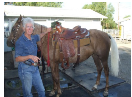
Renaissance Champagne ("Crystalina") with new owner

Yes, the weather certainly feels like fall - and rainy. There is a lot of cut hay lying in the fields between here and Klamath Falls. We were up there to visit our young ones who now live in Eagle Point, Oregon - at two fine hay farms owned by Morgan lovers. It was great to see them so happy and amidst such green pastures and experienced trainers. We were also pleased to see them recognize us - Sunny came right over to get a pat, and the girls showed off their training under saddle by being very well-behaved.